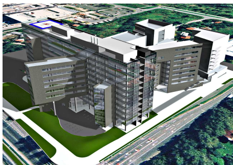
HYPO AAC, Zagreb, 2003. Business complex 85000 m 2